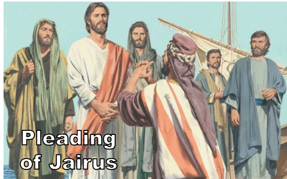
Pleading of Jairus

Lesson from Jesus: He took the faith that was there, and worked to GROW it.